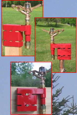
Elevated Sprinkler Mount

The Elevated Sprinkler Mount is designed for easy & fast setup. The ESM can be attached to a pole, or set on the end of a 2x4. Slots and holes facilitate use of nails, screws or wire to affix the ESM anywhere.