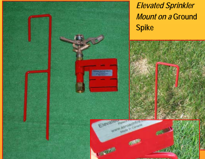
Elevated Sprinkler Mount on a Ground Spike

LESS PROPERTY DAMAGE FROM NAILS, LADDERS AND INAPPROPRIATE DIRECTION OF WATER