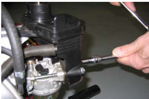
9) Install nuts and tighten