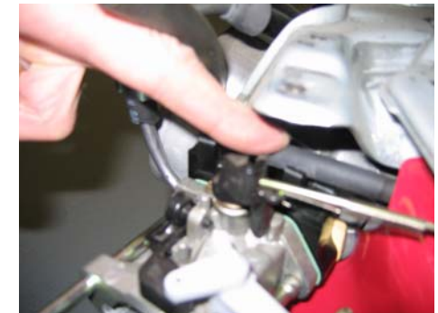
6) Reposition spark plug wire