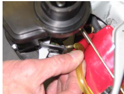
12) Fit clear fuel line onto carburetor