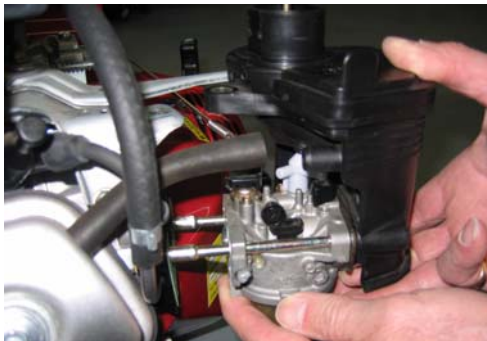
8) Locate carburetor, shroud gasket, and shroud on the ends of the studs and slide into place