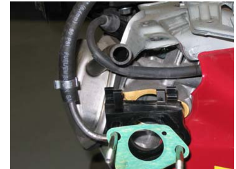
5) Install insulator equipped with pulse line and gaskets in the same orientation as they were removed