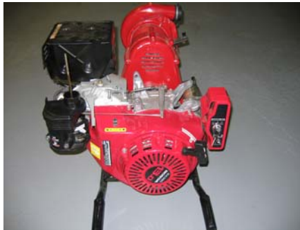
1) Remove fuel tank and air cleaner