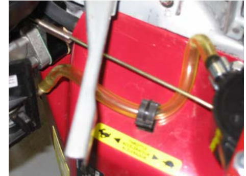
13) Locate fuel line as shown