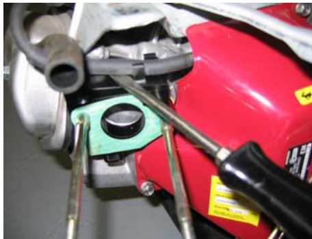
3) Release spark plug wire from insulator and remove insulator