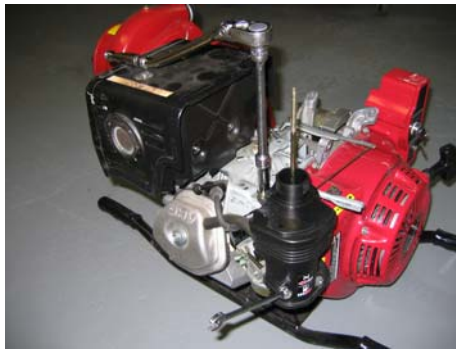
2) Remove carburetor. Note. It is not necessary to disconnect the throttle rod.