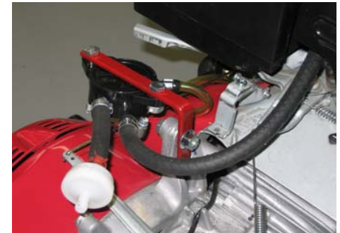
14) Connect pulse line as shown