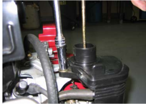
10) Install and tighten shroud mounting bolt