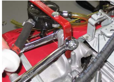
11) Mount pump on front fuel tank bracket using one of the fuel tank mounting bolts