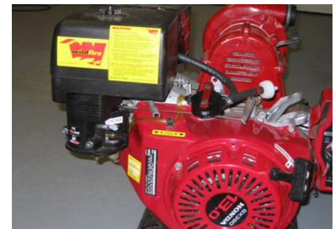
15) Ready for external fuel tank connection